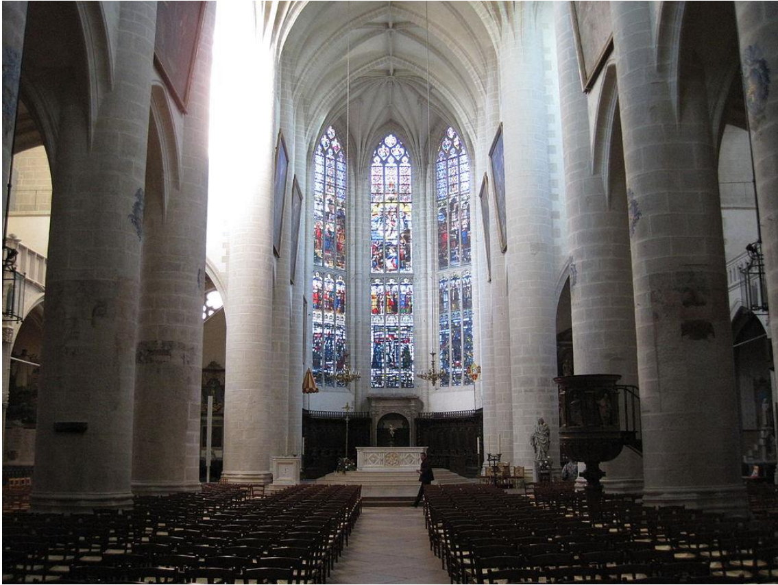
Collegiale Notre Dame, Dôle