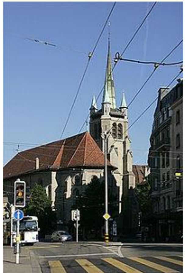
St. François, Lausanne