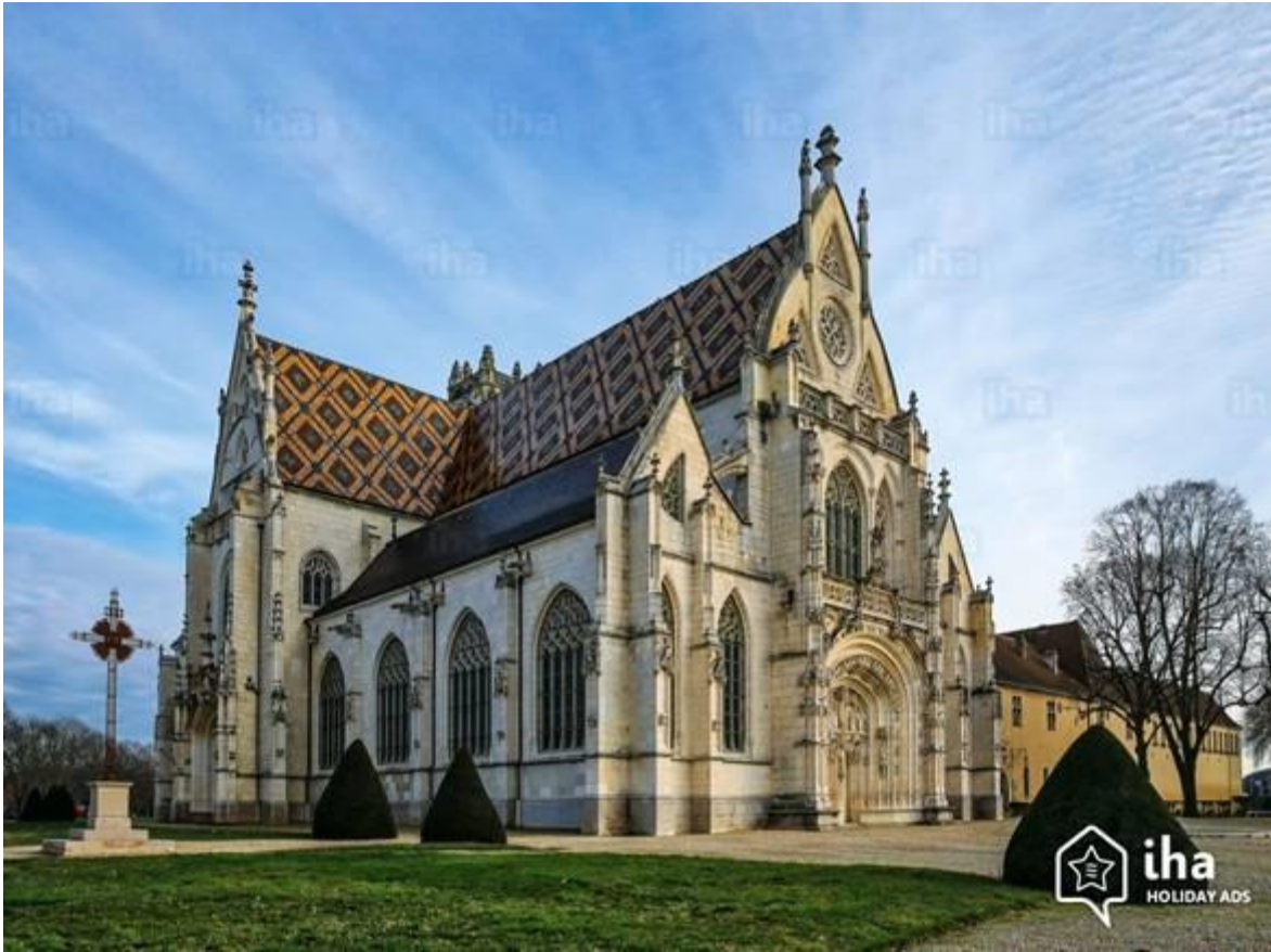
Royal Monastery of Brou, Bourg-en-Bresse