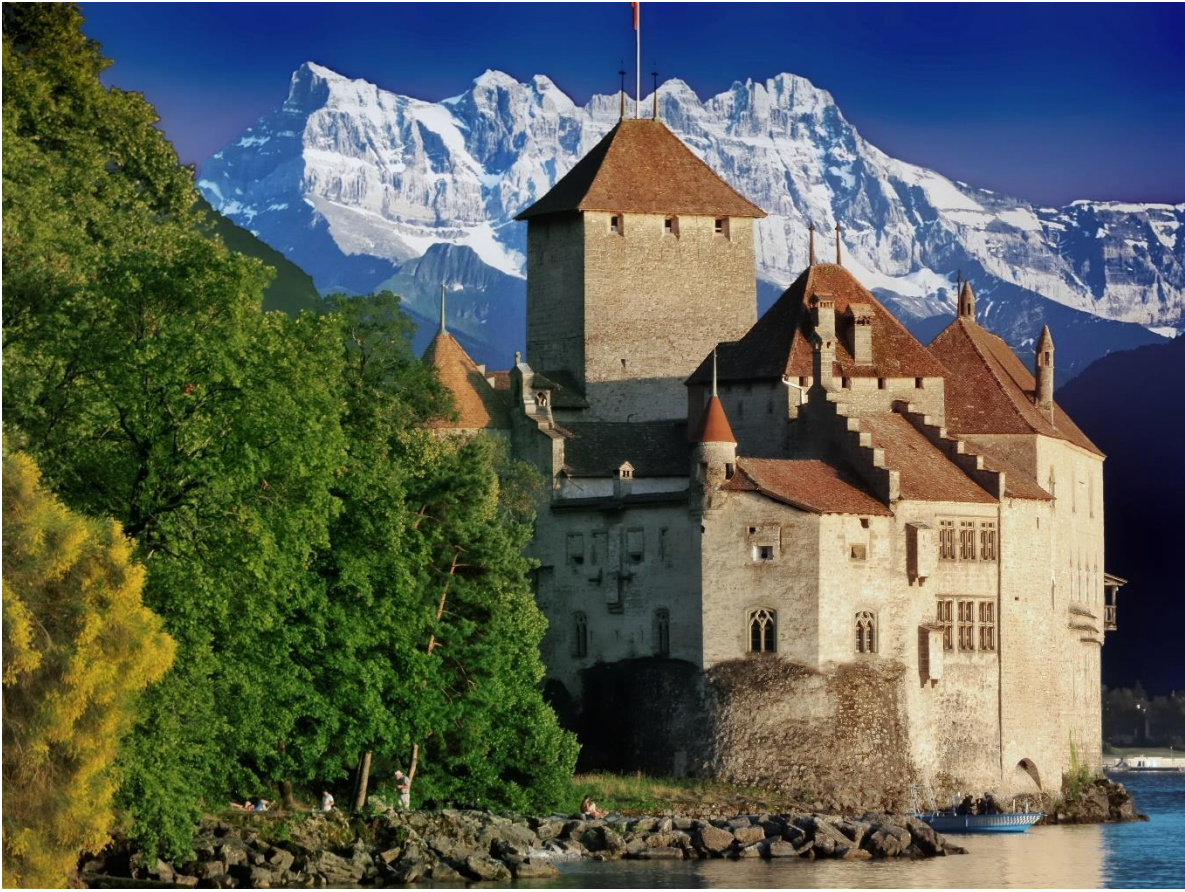
Chateau de Chillon