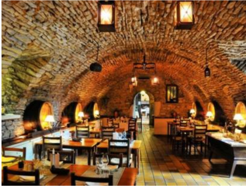
Le Cellier Volnaysien