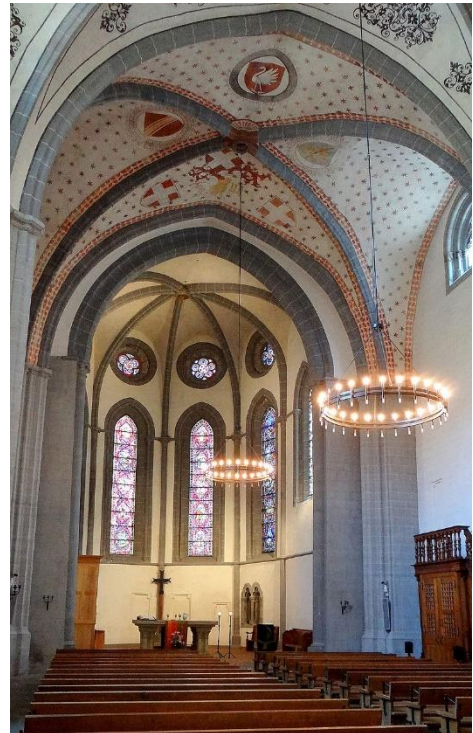
St. François, Lausanne