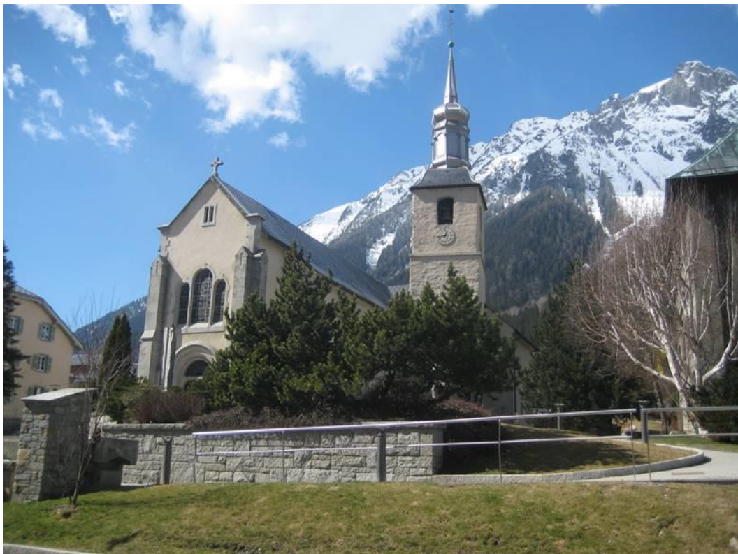
Église St-Michel, Chamonix-Mont-Blanc