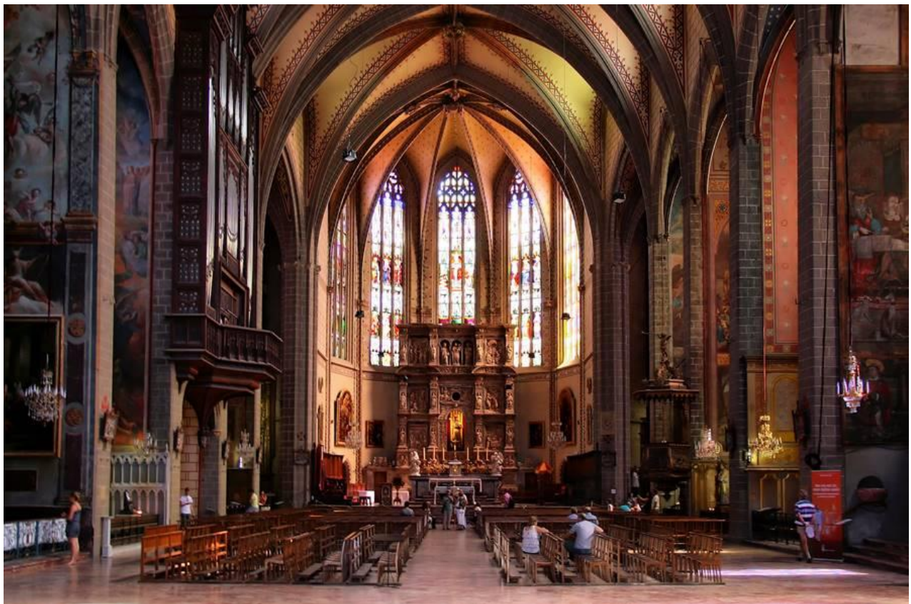
Cathédrale St-Jean Baptiste, Lyon